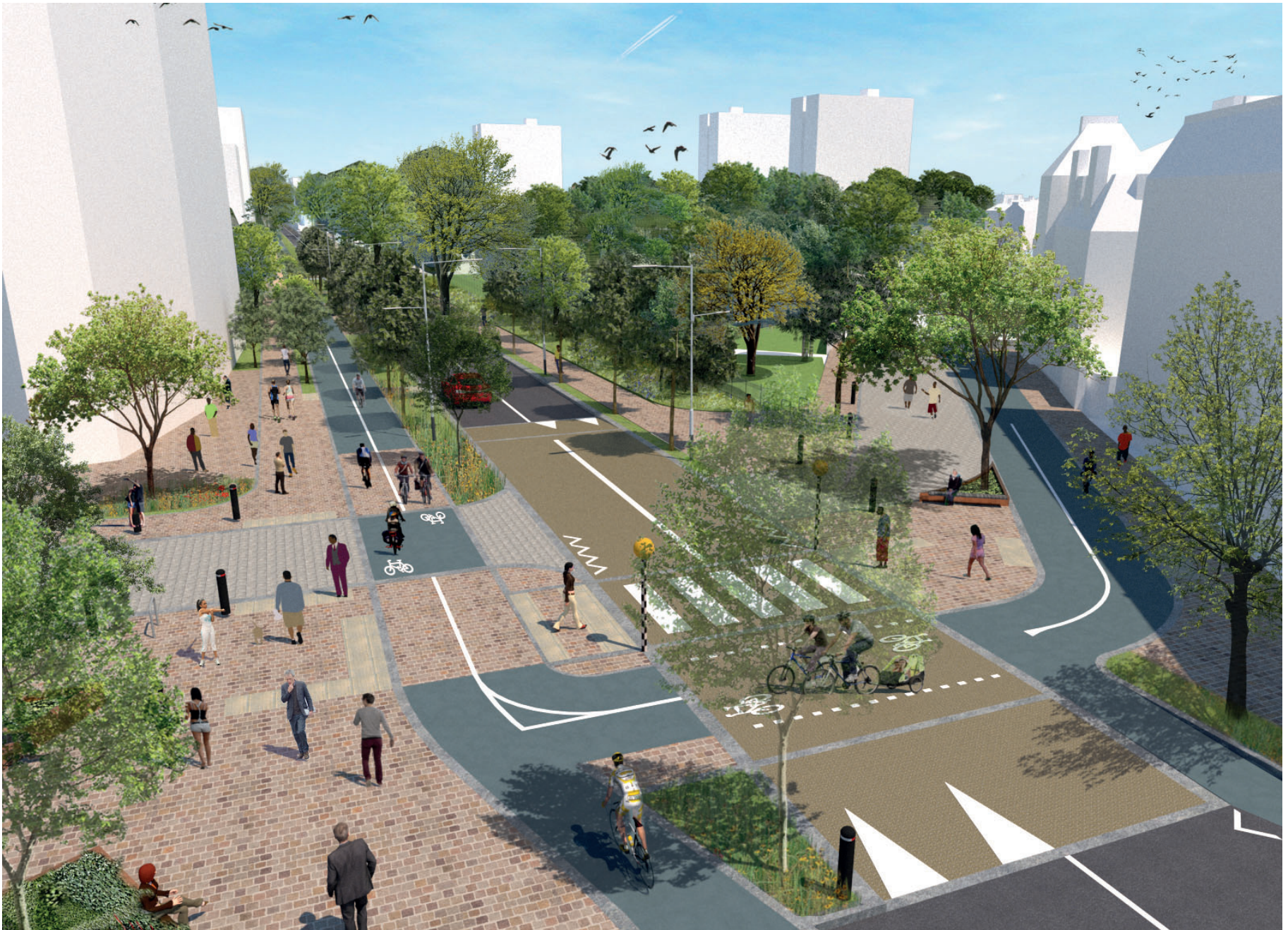
Illustrative concept image of the developing design proposals for Carlton Vale Boulevard.

Carlton Vale is set to be transformed into an ecologically diverse, tree-lined avenue with re-imagined public spaces and improved transportation links.